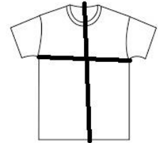
men's ex large