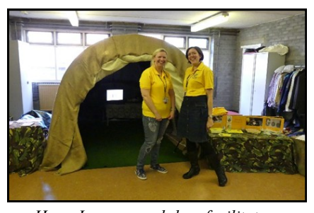
Hope Journey workshop facilitators