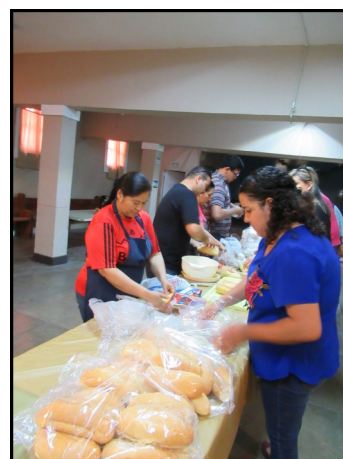
Mexican church members making sandwiches for migrants

There were poignant moments such as meeting the new mother with a three day old daughter, lying together on a mattress in a large room full of mattresses. She had been given space to rest, and was smiling, but one wondered what the future might hold. There were inspiring moments too. Many people from local churches have been working hard for many years to offer humanitarian support to the migrants, and they are determined to continue despite not having a great deal themselves. Their faith was so strong, and they were truly seeking to live it.