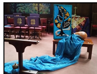
'Water of Life', Darlington