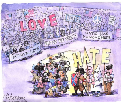
The need for 'countering toxic narratives'

Above right: 'Humanitarian Corridors': offering humanitarian protection to migrants in need