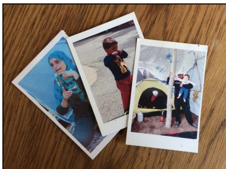
Encounters with some of the Syrian refugees now living in Greece.

As you will be aware, during this past year I was privileged to be able to visit refugees in Greece, with a group of eleven other women from Churches Together in Britain and Ireland. We met people who had made journeys that they never expected to need to make, to places to which they did not want to travel. They travelled away from the safety of the countries and cultures which they had called home, often facing treacherous journeys, before landing in foreign places where they were at the mercy of the kindness of strangers — or not.