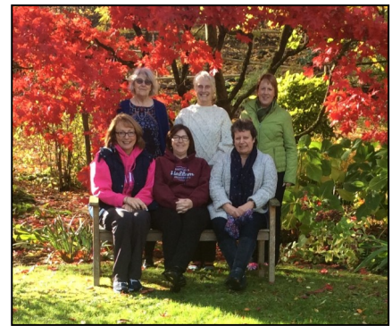
MWiB Executive members on retreat at beautiful Mill House in Devon

In early November the MWiB executive officers gathered at a retreat centre in Devon to reflect, review and recoup energy. For those of us who were local to the venue the third objective was probably easier than for those who had long journeys! One of the features of our role as a voluntary team of women, drawn from across the Connexion, is the need to travel whenever we meet. Travelling time can be a gift, affording space and thinking time, or a chore, when journeys are disrupted and trains overcrowded.