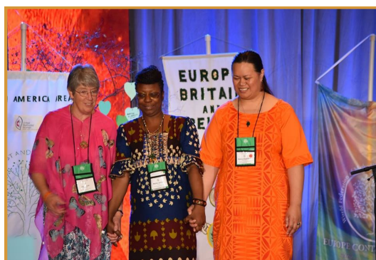
World President, Vice President and Secretary for 2016-2021

The new Connexional year has begun and I look forward to sharing the continuing story of Methodist Women in Britain with you, perhaps at the World Federation Day in Taunton in October.