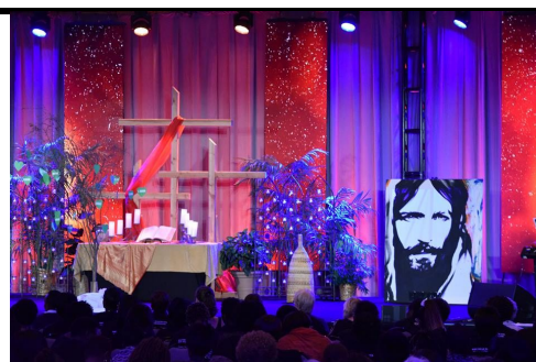
Worship Focus at the World Assembly