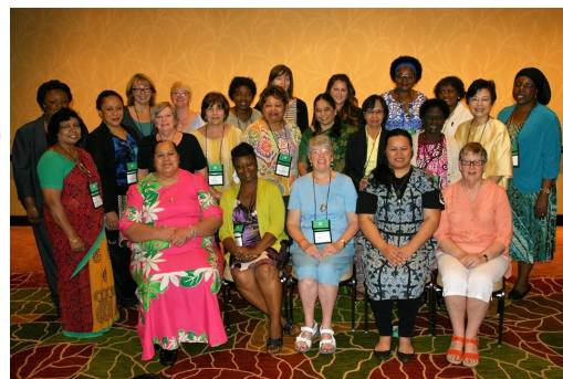
World and Area Officers 2016-2021

Those of us who were able to attend would like to bring a flavour of the World Assembly back to the UK so to celebrate World Federation Day; we are holding a "Taste of Texas" day.