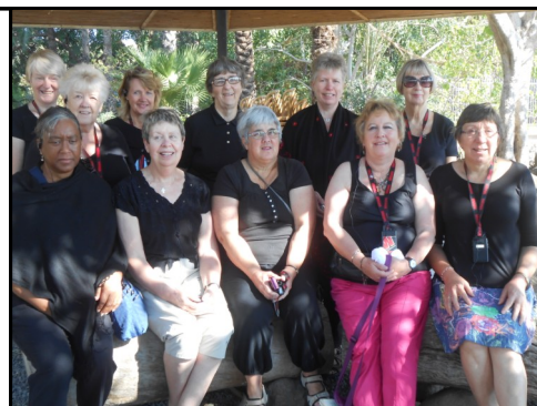
Thursday in black at Tabgha

For ten nights in November, 34 MWiB pilgrims travelled together through the Holy Land. We were a mixed bunch, ranging in age from 25 to 80; there were two past presidents of MWiB and a number who knew very little of the movement; there was a mother and daughter pair, and another pair of schoolfriends, who now live hundreds of miles apart. The idea of a women-only Christian pilgrimage had attracted us all for different reasons, and that enabled many to undertake something very special that they might not have been able to do otherwise.