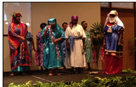
Above: Samoan ladies portraying the story of Hannah mother of Samuel