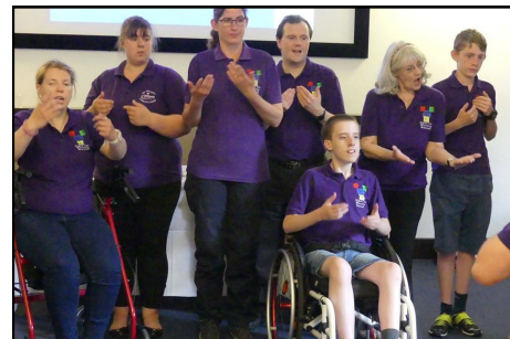
Members of the Walsall 'Signs for Worship' choir