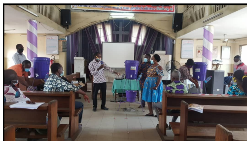
Training the Trainers at Bethesda Church

You can find information and prayers from Togo on Day 3 in the 2020–2021 Methodist Prayer Handbook, The Earth is the Lord's .