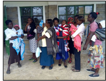
Mother-to-Mother: working with disabled children in Kenya

Every year MWiB is able to give £10,000 to projects overseas, and in September this year the MWiB Forum agreed to accept all nine applications received via Forum reps. These gifts, though relatively small, make a huge difference to people's lives. These are some of the comments received when we notified projects of their success in receiving a gift: