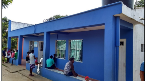
The clinic, IPS Clinton Rabb, in Brisas del Mar. The clinic provides essential health services to the 3000 people - comprising an exam room, a labour and delivery room (also used for minor surgery), a dental office, a pharmacy, and a room for overnight stays.