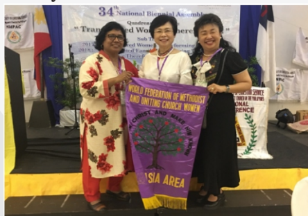
EAA Officers at the Assembly

simultaneously. The four-day Assembly ended with Closing Worship, Commitment Service and Holy Communion.