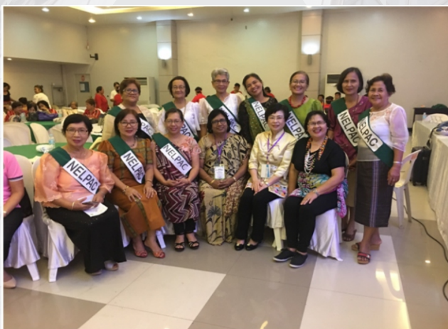
Philippines Annual Conference and EAA Officers

Three EAA officers attended the 34th National United Methodist Women's Society of Christian Service Assembly at The Subic Peninsular Hotel in the Philippines from 19th to 22nd April 2018. The Assembly theme was "Transformed Women, Therefore Go!" The Women's Society in the Philippines has been serving faithfully and diligently. Many families have been witnessing for Jesus Christ. In the region, they have helped the poor, empowered the oppressed and provided practical support to the socially disadvantaged. During the Assembly, the EAA officers had the pleasure of presenting the hymn "Blessed Assurance" in English, Chinese and Tamil