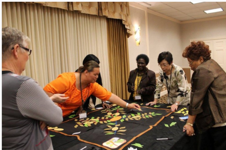
Photo of World Executive members using Ketso

At our World Executive meeting in Chicago in March, we used a resource called Ketso ( www.ketso.com ) and the