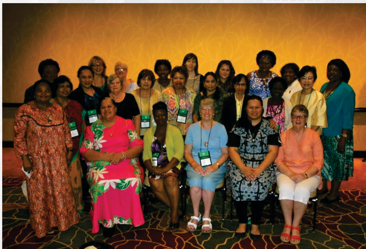
Photo of the New Executive

secondary education in Malaysia. In 1973, she obtained a Business Management Diploma from Otago, New Zealand. In 1976, she went to Hong Kong to work as a company secretary and